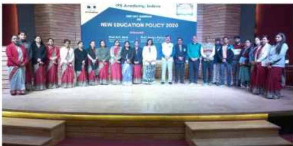
A seminar was held on NEW EDUCATION POLICY