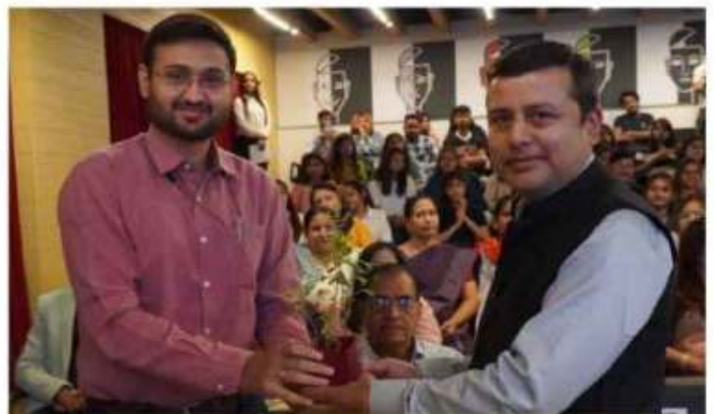
Reward and Certificate Distribution Ceremony of Institute of Fashion Technology, IPS Academy, Indore