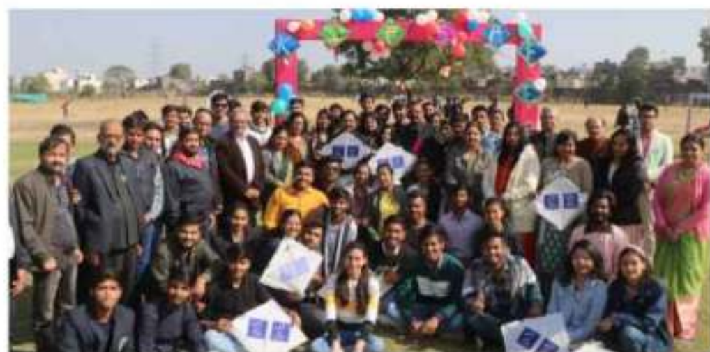
Kite Festival was organised on the occasion of Makar Sankranti