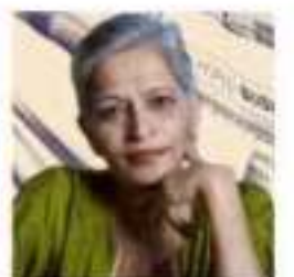
Lt. Gauri Lankesh

Journalism offers women a viable career choice, providing a platform to express their thoughts and viewpoints to society. Whether as editors, story writers, or field journalists, women can easily find suitable roles that resonate with their aspirations.