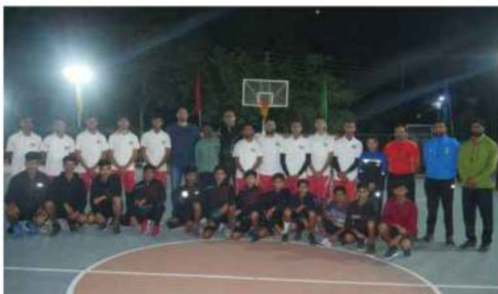
BASKET BALL TOURNAMENT