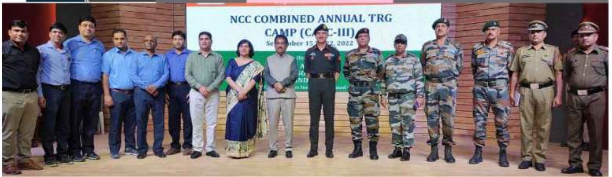
NCC ANNUAL TACTICAL RECONNAISSANCE GROUP CAMP