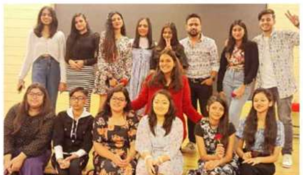
INDUCTION PROGRAM OF IMC