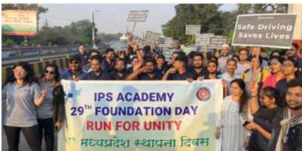
On the occasion of 29th Foundation Day RUN FOR UNITY was organised.