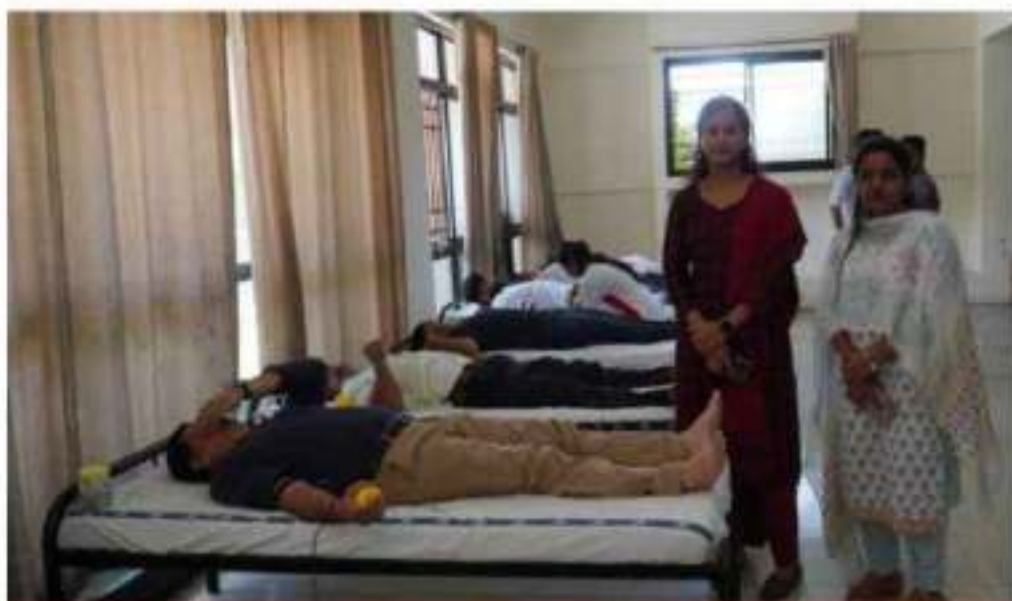
Blood Donation Camp was organised at IPS Academy, Indore on the occasion of Indore Gaurav Divas.