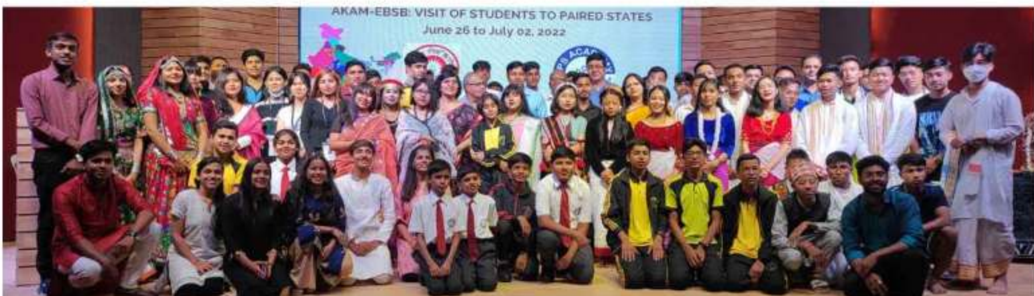
Visit of Students to Paired States