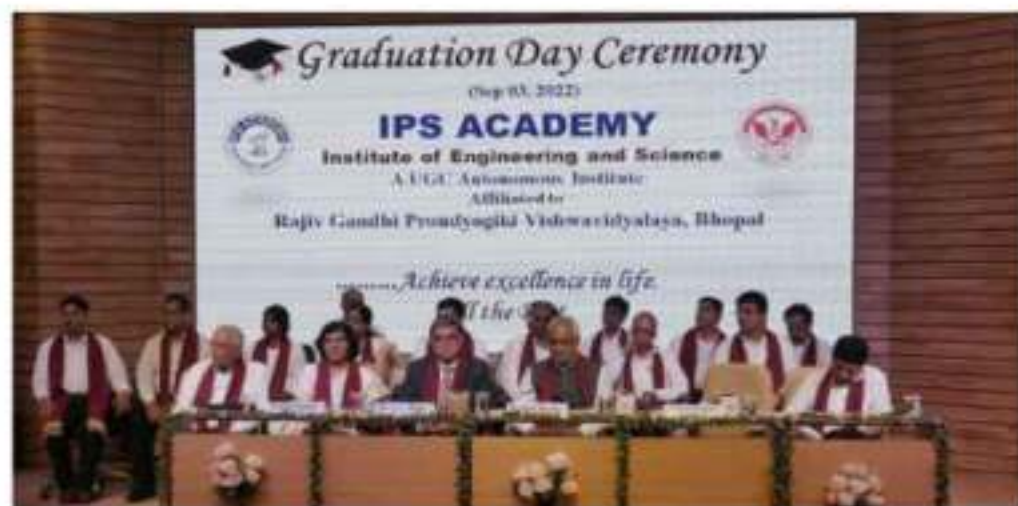
Graduation Day Ceremony (IES)