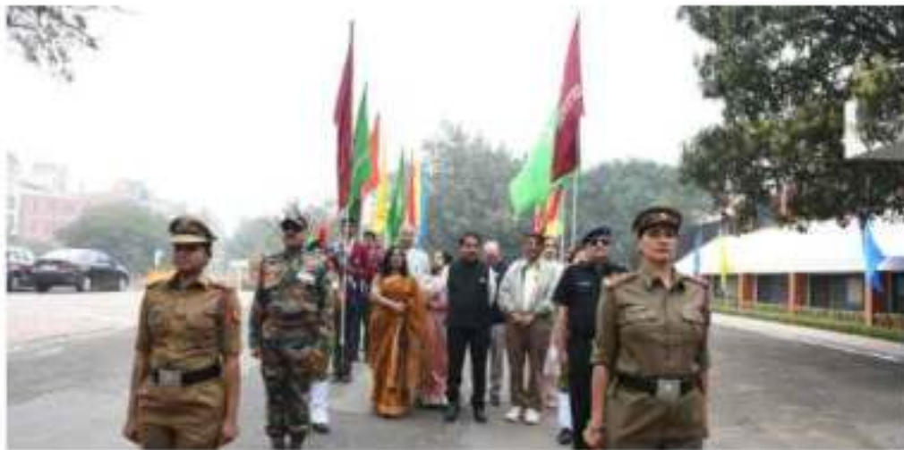
Republic Day Celebration 2023