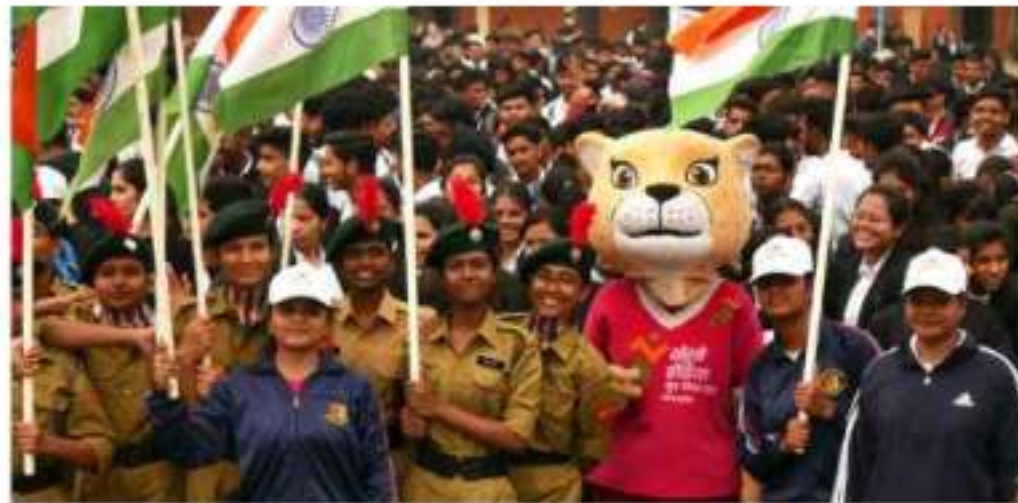
Khelo India Games