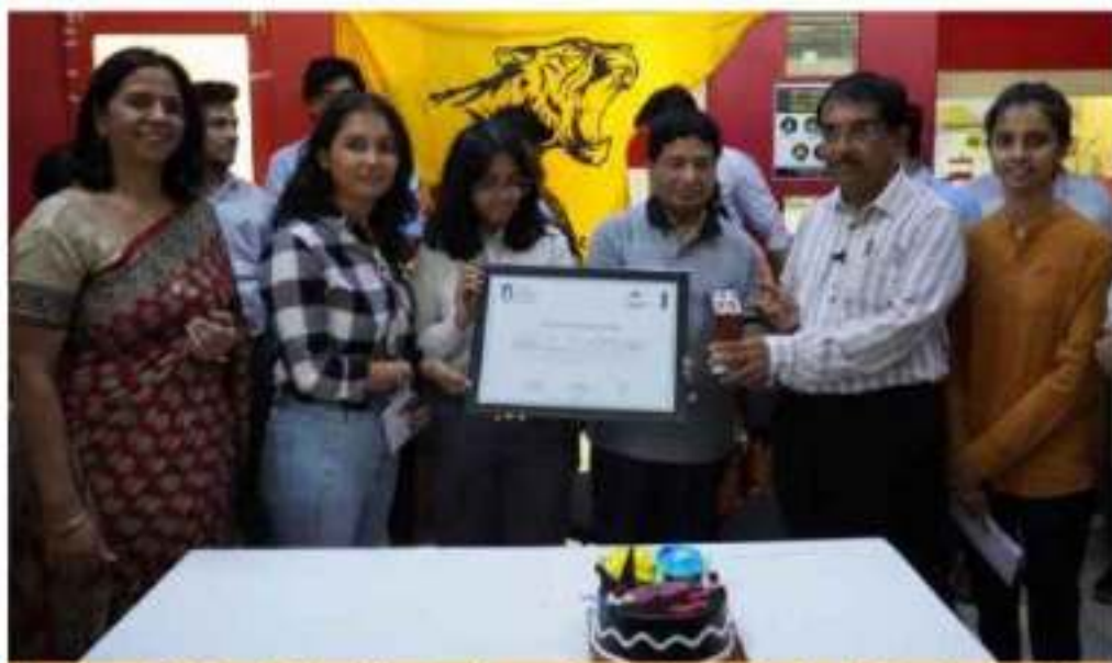
Students of School of Architecture bagged second position in the Battle of Bands at Lovely Professional University, Jalandhar