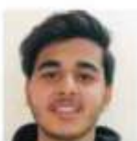
By: Dhruv Vyas BAMC 4th Sem

Overall, "Atomic Habits" is a practical and easy-to-read guide that can help anyone improve their habits and achieve their goals. It teaches us that small changes can lead to big results and that by focusing on continuous improvement, we can make progress towards our goals and lead happier, more fulfilling lives.