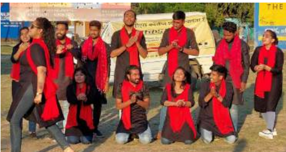
The department of NSS/IPSSR conducts nukkad natak on several topics to raise awareness in society at Sanwer local market.