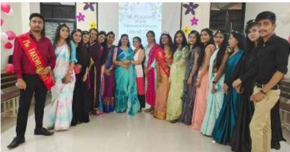
Farewell conducted for M.Sc. Students of Batch 2020-22