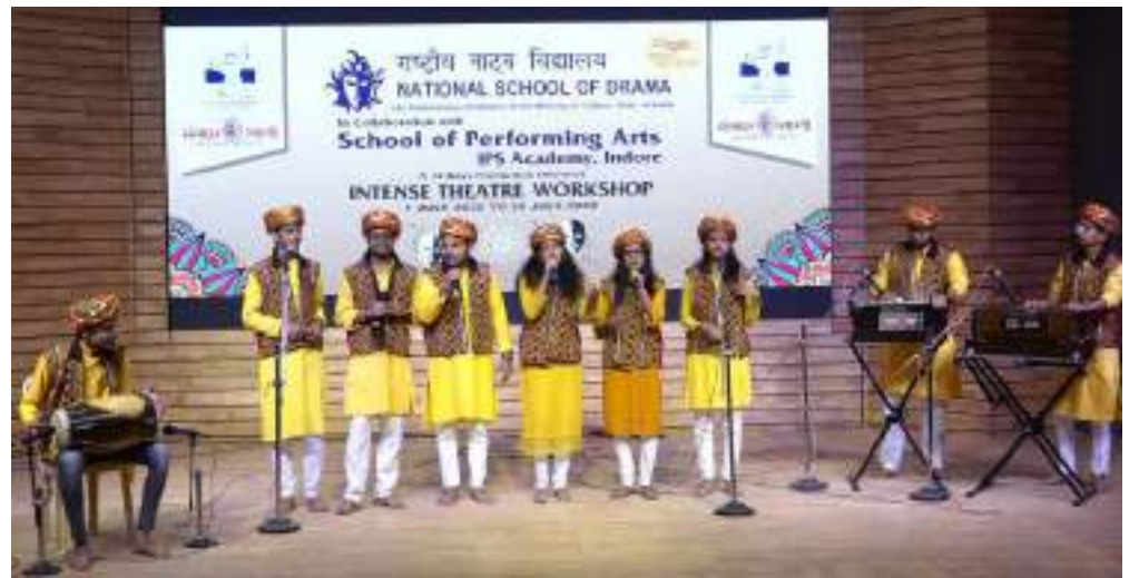
National School of Drama (NSD), New Delhi along with School Of Performing Arts, IPSA organized a 30 days production oriented Acting and Theatre Workshop from 1st-30th July 2022.