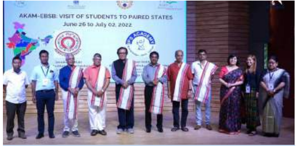
Students Exchange Program at Engineering Dept. Students from Manipur and Nagaland under the scheme Ek Bharat Shrestha Bharat (EBSB) visited IPSA