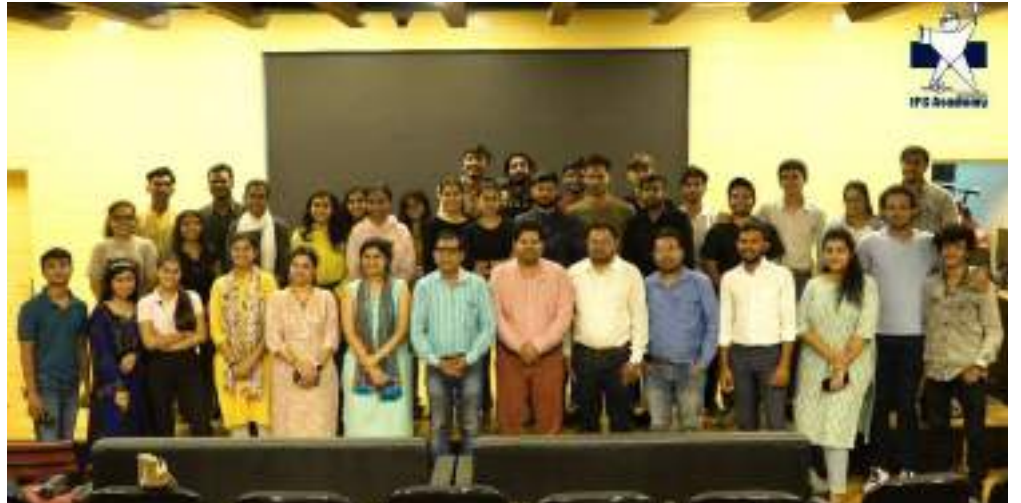
Audition for talent performers of the Academy for IPSA Radio 91.2FM