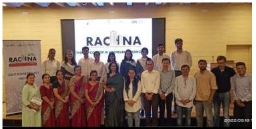
Architecture Dept., IPSA, hosted a 2- day event Under the Ministry of Housing and Urban affairs MoHUA to help students learn about the innovative construction technologies.