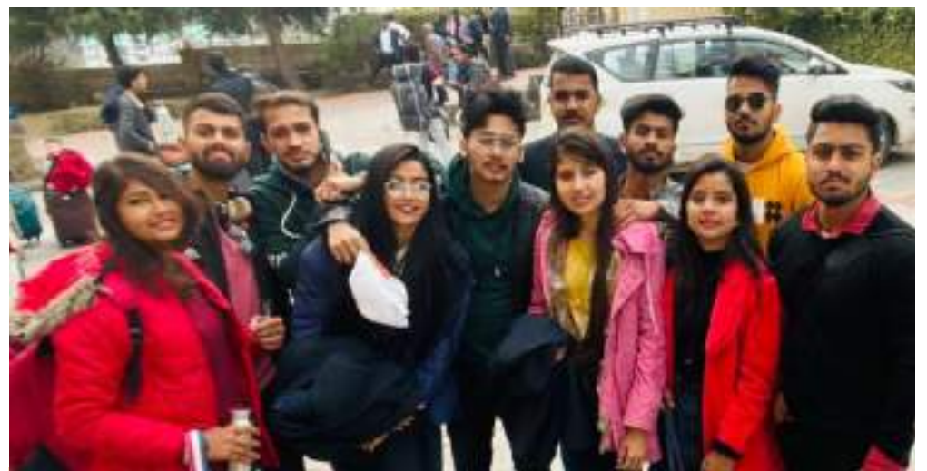
School of Travel and Tourism organized an Industrial Tour for 7 days for the students which covered Chandigarh, Ambala Cantt, Dalhousie, Khajjiar, Chamba, Dharamshala-Macleodganj, Amritsar- Wagha/Attari Border.