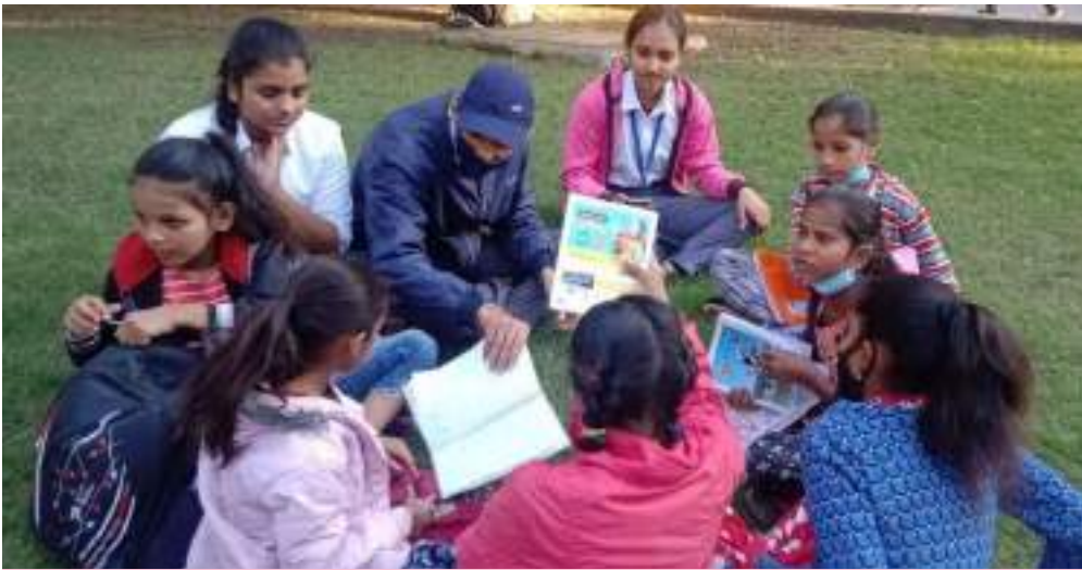
Gyan Vistar program at IPS Academy by NSS/IPPSR department to teach the underprivileged children