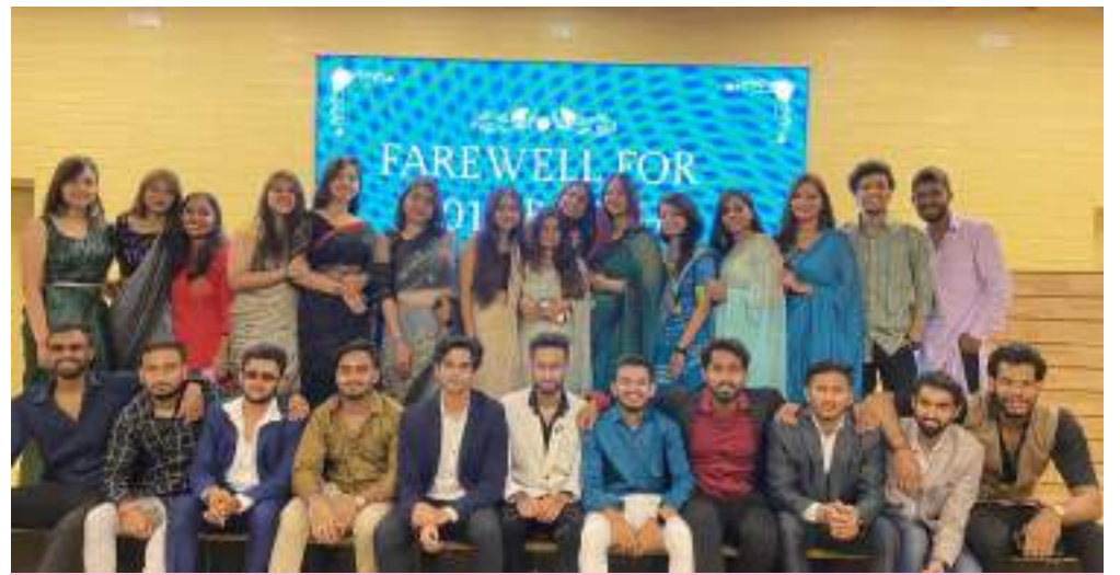
Farewell for 2022 batch conducted at Mass Communication Dept. IPS Academy