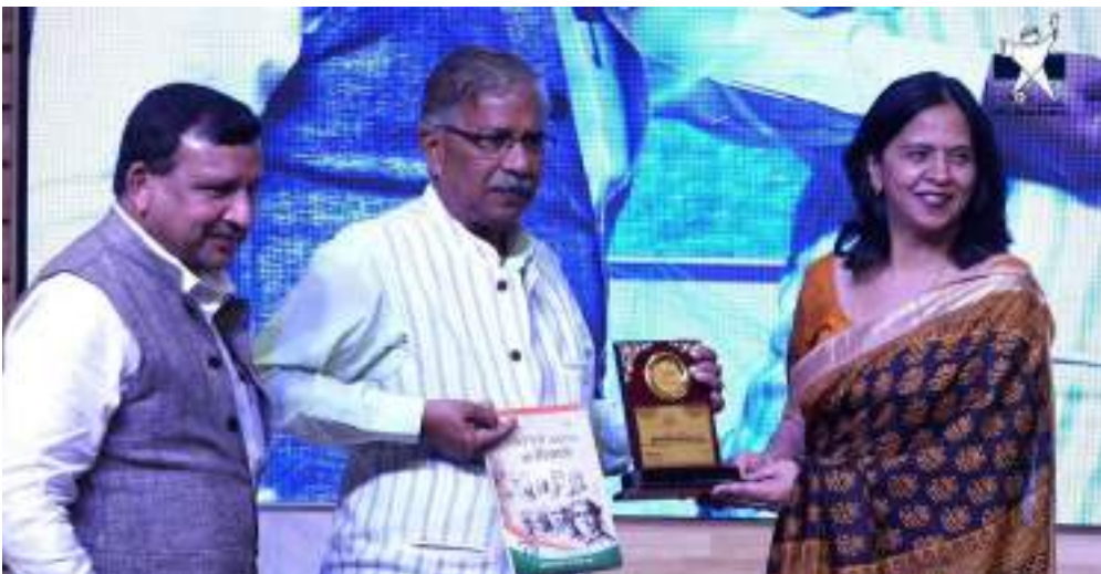
Award Ceremony hosted by School Of Architecture for National Level Architectural Design Competition for the Scientist's Memorial organized by #MPCST Bhopal